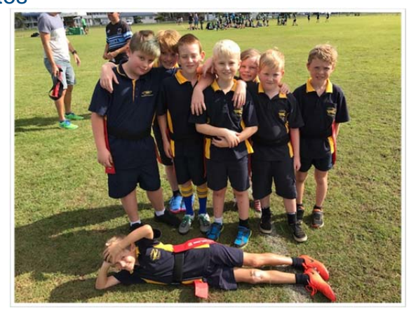
Junior Oztag Team